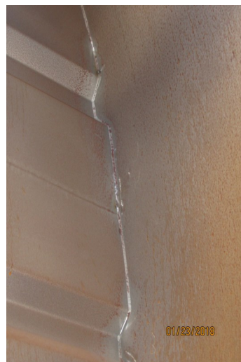
Interior weld quality is superb

doubt that they can ramp up to build quite a few more than that if need be.