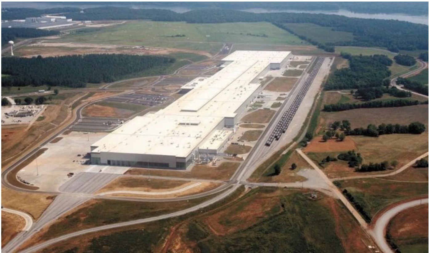
FreightCar America plant Cherokee, AL; exterior shot